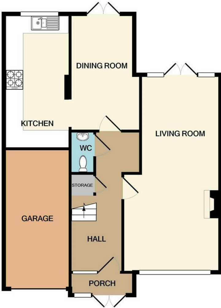
GROUND FLOOR APPROX. FLOOR AREA 699 SQ.FT. (64.9 SQ.M.)